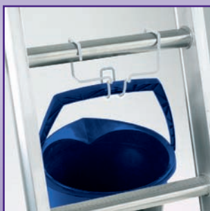
Bucket Hook 45011