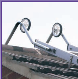
Roof Hook 45005