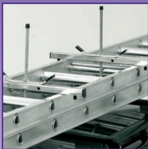
Roof Rack Clamps 45016

Our range of ladder accessories are designed to ensure easier and safer working on ladders.