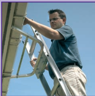
Stand Off 45020