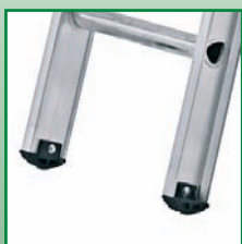
Ribbed feet for extra grip