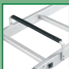
Rubber support bar