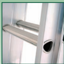
Wide non-slip 'D' rungs

Suitable for professional and domestic use