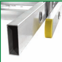
Box section stiles