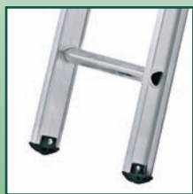
Heavy duty contoured feet