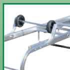
Wheels for easy manoeuvring on roof