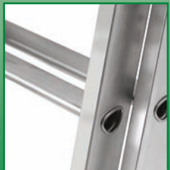
Wide non-slip 'D' rungs