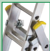
Secure top brackets